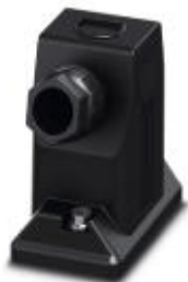
HEAVYCON ADVANCE B6 sleeve housing, with screw locking (Allen screw), plastic, height: 100 mm, with 1 x M20 thread, lateral cable outlet

Please be informed that the data shown in this PDF Document is generated from our Online Catalog. Please find the complete data in the user's documentation. Our General Terms of Use for Downloads are valid ( http://download.phoenixcontact.com )