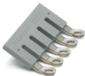
Insertion bridge, Number of positions: 5, Color: gray

Please be informed that the data shown in this PDF Document is generated from our Online Catalog. Please find the complete data in the user's documentation. Our General Terms of Use for Downloads are valid ( http://phoenixcontact.com/download )