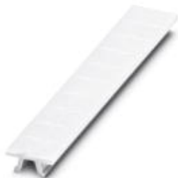
Zack marker strip, 10-section, horizontally labeled with the consecutive numbers: 191 ... 200, white, Width: 6 mm

Please be informed that the data shown in this PDF Document is generated from our Online Catalog. Please find the complete data in the user's documentation. Our General Terms of Use for Downloads are valid ( http://download.phoenixcontact.com )