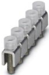
Fixed bridge, Number of positions: 5, Color: silver

Please be informed that the data shown in this PDF Document is generated from our Online Catalog. Please find the complete data in the user's documentation. Our General Terms of Use for Downloads are valid ( http://phoenixcontact.com/download )