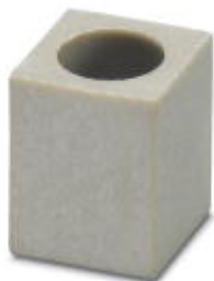
Bridge bar isolator, Color: beige

Please be informed that the data shown in this PDF Document is generated from our Online Catalog. Please find the complete data in the user's documentation. Our General Terms of Use for Downloads are valid ( http://phoenixcontact.com/download )