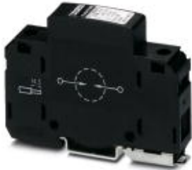
Lightning current arrester with encapsulated N-PE spark gap and ignition electronics, 1-channel. Protection level 1.5 kV. Housing width: 17.5 mm (1 Div.)

Please be informed that the data shown in this PDF Document is generated from our Online Catalog. Please find the complete data in the user's documentation. Our General Terms of Use for Downloads are valid ( http://phoenixcontact.com/download )