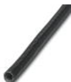
Galvanized steel protective hose with PVC coating, 1 Pcs. / Pkt. = roll à 10 m

Protective hose - WP-STEEL PVC C 27 - 3240871