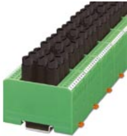
Fuse module, for 8 cartridge fuse inserts, 5 x 20 mm, common connection point

Please be informed that the data shown in this PDF Document is generated from our Online Catalog. Please find the complete data in the user's documentation. Our General Terms of Use for Downloads are valid ( http://download.phoenixcontact.com )