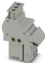
Plug, 3-pos. with integrated, automatic short circuit function

Please be informed that the data shown in this PDF Document is generated from our Online Catalog. Please find the complete data in the user's documentation. Our General Terms of Use for Downloads are valid ( http://phoenixcontact.com/download )