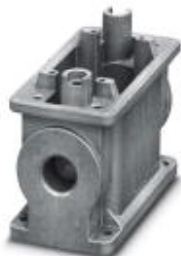
HEAVYCON ADVANCE B10 basic housing without screw openings, for M6 screw locking, salt-water-resistant aluminum, without surface coating

Please be informed that the data shown in this PDF Document is generated from our Online Catalog. Please find the complete data in the user's documentation. Our General Terms of Use for Downloads are valid ( http://phoenixcontact.com/download )