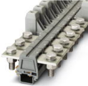
Empty housing, Color: gray

Please be informed that the data shown in this PDF Document is generated from our Online Catalog. Please find the complete data in the user's documentation. Our General Terms of Use for Downloads are valid ( http://phoenixcontact.com/download )