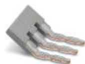
Insertion bridge, Number of positions: 3, Color: gray