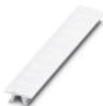
Zack marker strip, Strip, white, labeled, can be labeled with: Plotter, Printed vertically: Consecutive numbers 1 - 10, 11 - 20, etc. up to 491 - 500, Mounting type: Snap into tall marker groove, for terminal block width: 6.2 mm, Lettering field: 6.15 x 10.5 mm

Zack marker strip - ZB 6,QR:FORTL.ZAHLEN - 1051029