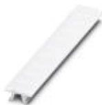
Zack marker strip, Strip, white, labeled, can be labeled with: Plotter, Printed horizontally: Consecutive numbers 1 - 10, 11 - 20, etc. up to 491 - 500, Mounting type: Snap into tall marker groove, for terminal block width: 6.2 mm, Lettering field: 6.15 x 10.5 mm

Zack marker strip - ZB 6,LGS:FORTL.ZAHLEN - 1051016