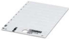
The figure shows a version of the article

Snap-in markers, Card, white, unlabeled, can be labeled with: THERMOMARK CARD, Mounting type: snapped into marker carrier, Lettering field: 35 x 15 mm