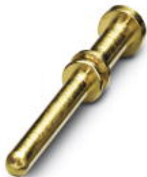
Crimp contact, turned, Single contact, contact diameter: 2 mm, crimp range: 1 mm 2 ... 2.5 mm 2

Please be informed that the data shown in this PDF Document is generated from our Online Catalog. Please find the complete data in the user's documentation. Our General Terms of Use for Downloads are valid ( http://phoenixcontact.com/download )