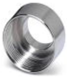
Step-up adapter, M20 to M25, including O-ring

Extension adapter - ENLAR-M-KV-M20/M25 - 1647666