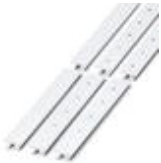
Zack marker strip, can be ordered: Strip, white, labeled according to customer specifications, Mounting type: Snap into tall marker groove, for terminal block width: 15.2 mm, Lettering field: 10.5 x 15.1 mm

Marker for terminal blocks - ZB 15,LGS:L1-N,PE - 0811998