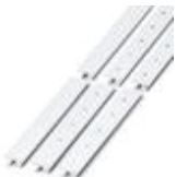
Marker for terminal blocks, Strip, white, labeled, Printed horizontally: L1, L2, L3, N, PE, Mounting type: Snap into tall marker groove, for terminal block width: 15.2 mm, Lettering field: 10.5 x 15.1 mm

Marker for terminal blocks - ZB 15,LGS:L1-N,PE - 0811998