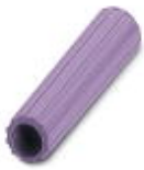
Insulating sleeve, Color: violet