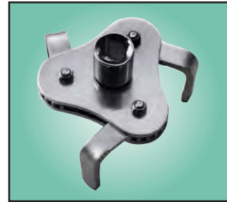
Two-way action installs or removes filters

Tools that have been specially designed to your greatest conveniences: