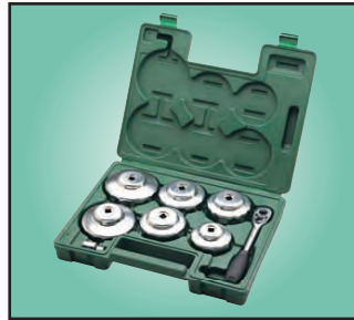
Specially designed wrench removes and installs hard-to-reach oil filters