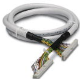
Round cable set, with two 14-pos. socket strips (1:1 connection), for connecting 8 channels, cable length: 8 m

Please be informed that the data shown in this PDF Document is generated from our Online Catalog. Please find the complete data in the user's documentation. Our General Terms of Use for Downloads are valid ( http://phoenixcontact.com/download )