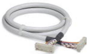
The illustration shows a 20-position version

Round cable set, with two 16-pos. socket strips (1:1 connection), cable length: 0.5 m