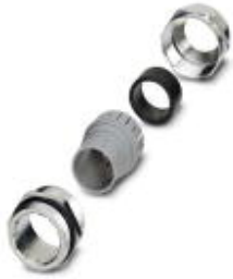
Brass screw connection, PG21

Please be informed that the data shown in this PDF Document is generated from our Online Catalog. Please find the complete data in the user's documentation. Our General Terms of Use for Downloads are valid ( http://phoenixcontact.com/download )