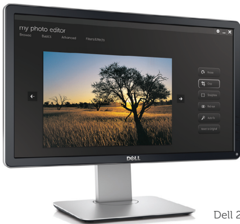
Dell 20 Monitor | P2014H (19.5", 49.41 cm VIS)