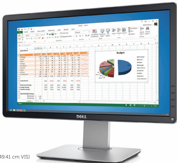
Dell 20 Monitor | P2014H (19.5", 49.41 cm VIS)