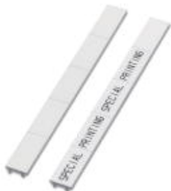
Contactor marker – zack marker strip, Strip, white, Unlabeled, Can be labeled with: Plotter, Mounting type: Snap into flat marker groove, Lettering field: 20 mm x 8 mm

Please be informed that the data shown in this PDF Document is generated from our Online Catalog. Please find the complete data in the user's documentation. Our General Terms of Use for Downloads are valid ( http://download.phoenixcontact.com )