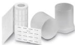
The figure shows the EML (20X8)R product variant

Label, Roll, silver/matt, unlabeled, can be labeled with: THERMOMARK ROLL, THERMOMARK ROLL X1, THERMOMARK X, THERMOMARK S1.1, Mounting type: Adhesive, Lettering field: 101.6 x 25.4 mm