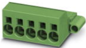
The illustration shows the 5-pos. version

Plug component, Nominal current: 76 A, Rated voltage (III/2): 1000 V, Number of positions: 4, Pitch: 10.16 mm, Connection method: Spring-cage connection, Color: green, Contact surface: Silver