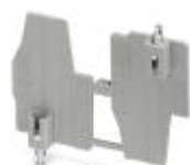
Flange cover, Length: 45.7 mm, Width: 4.5 mm, Height: 32 mm, Color: gray