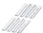
Zack Marker strip, flat, Can be ordered: Strip, white, Labeled according to customer specifications, Mounting type: Snap into flat marker groove, For terminal block width: 5 mm, Lettering field: 5.15 x 5.15 mm

Zack Marker strip, flat - ZBF 5 CUS - 0825025