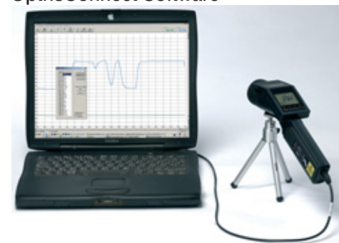
OptrisConnect oscilloscope software with 20 readings per second