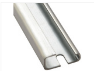
DIN rails DIN EN 60715 G 32

For M/T 219-220, M/T 231-235, M/T 238, M/T 246, P 325, M/T 2381