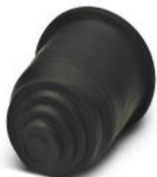
End sleeves, transition sleeves, from hose to cable

Please be informed that the data shown in this PDF Document is generated from our Online Catalog. Please find the complete data in the user's documentation. Our General Terms of Use for Downloads are valid ( http://phoenixcontact.com/download )