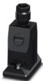
HEAVYCON ADVANCE B6 sleeve housing, with screw locking (Allen screw), plastic, height: 100 mm, with 1 x M20 thread, straight cable outlet

Please be informed that the data shown in this PDF Document is generated from our Online Catalog. Please find the complete data in the user's documentation. Our General Terms of Use for Downloads are valid ( http://download.phoenixcontact.com )